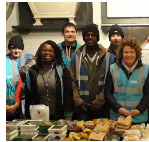
Addressing poverty and inequality.