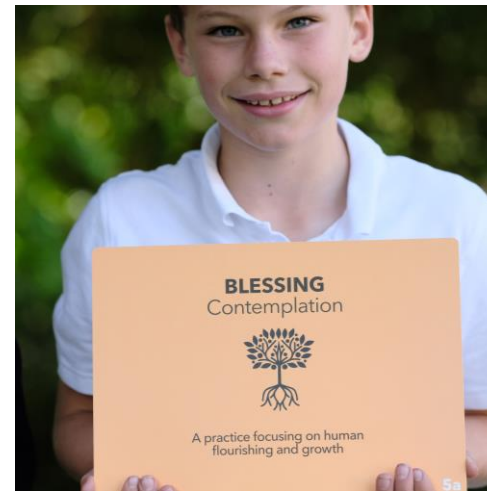
Schools, children and young people