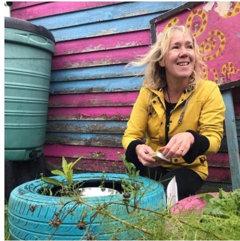
Growing new congregations