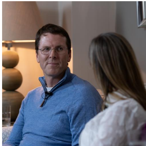
Formation & discipleship