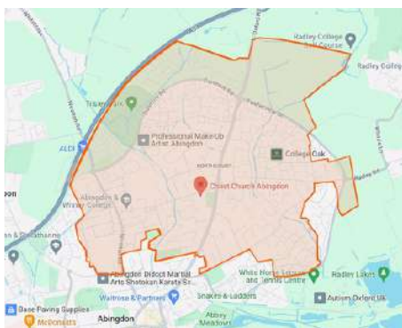
Approximate Guide of the North Abingdon Parish Boundary (2024)

The parish of North Abingdon (Christ Church) is largely residential, with small areas of local retail, and some small industrial units. It was developed almost entirely in the period following World War Two; initially to serve the science laboratories approximately 10 miles south of the town and further developments being added in the decades up to the 1990s.